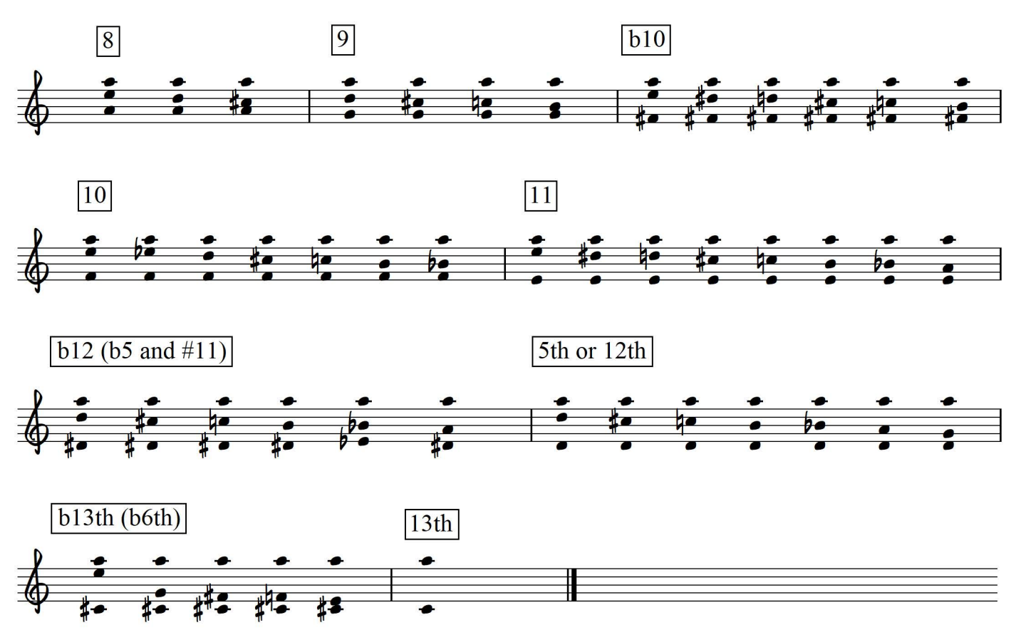
3-Voice (one of which is a pedal) Studies.

Side Trip: 2-voice with delays: sounds like 3.