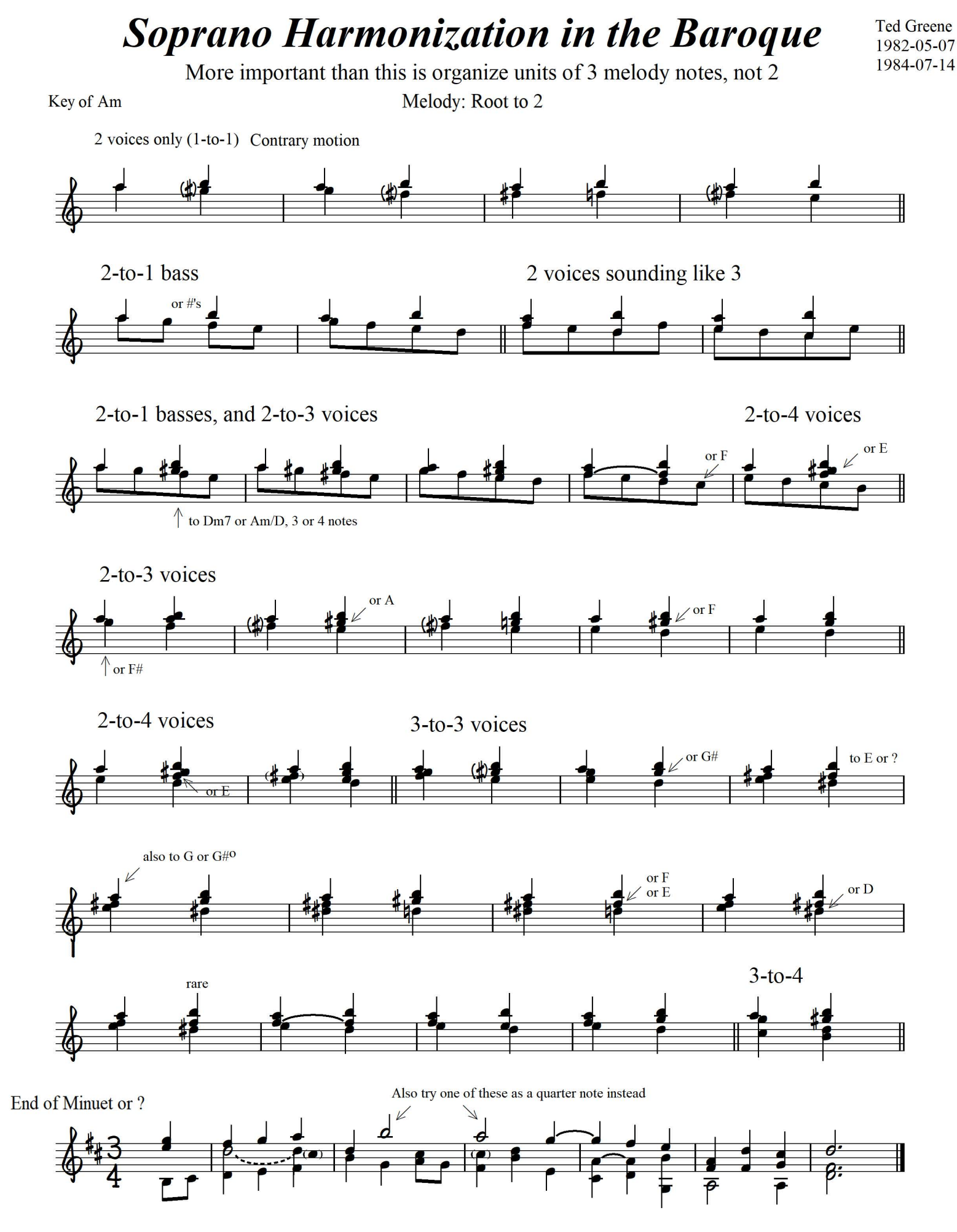
In 1-to-1, try moving any voice in 2-to-1 anywhere (metrically).