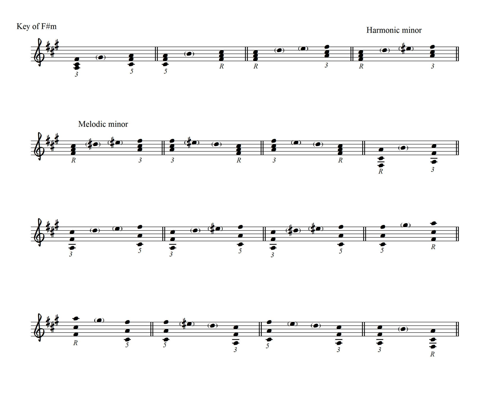
Practice connecting all I triads to IV, V via passing tones. (Also do in minor keys with i, iv, V.)